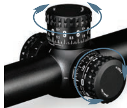
Windage Turret Dial