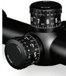
MOA Adjustment 1 Click = 1/8 MOA

MOA unit of arc measurements are based on degrees and minutes. A minute of angle will subtend 1.05 inches at a distance of 100 yards (29.1 mm at 100 meters). This riflescope uses 1/8 minute clicks which subtend .13 inches at 100 yards (3.6 mm at 100 meters), .26 inches at 200 yards (7.2 mm at 200 meters), .39 inches at 300 yards (10.8 at 300 meters), etc.