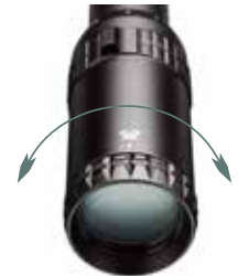
Rotate ring to adjust the magnification.

To change the magnification, turn the magnification ring to the desired level.