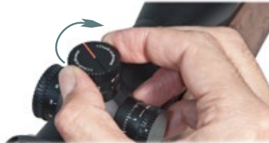
Point at which the knob stops turning.

Note: If re-zeroing at a future time, be sure to remove all CRS shims before sight-in.