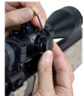
Align the windage turret cap.

Once the windage and elevation knobs are correctly indexed to the zero mark, temporary corrections can be safely dialed into the scope without worry of losing the original zero.