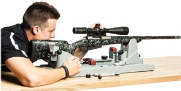
Visually bore-sighting a rifle.