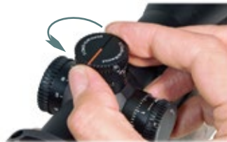
Correct alignment for zero point.