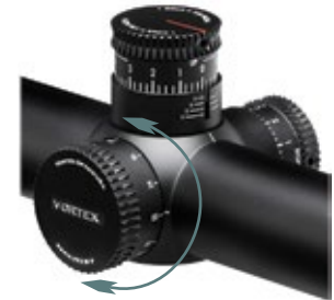
Turn Side Focus Knob

Parallax is a phenomenon that results when the target image does not quite fall on the same optical plane as the reticle within the scope. This can cause an apparent movement of the reticle in relation to the target if the shooter's eye is off-centered. Correctly focusing the target image will allow it to fall on the same optical plane as the reticle within the riflescope.