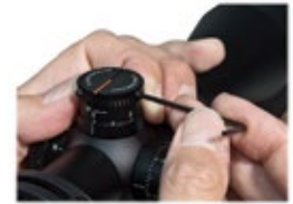
Align the elevation turret cap.